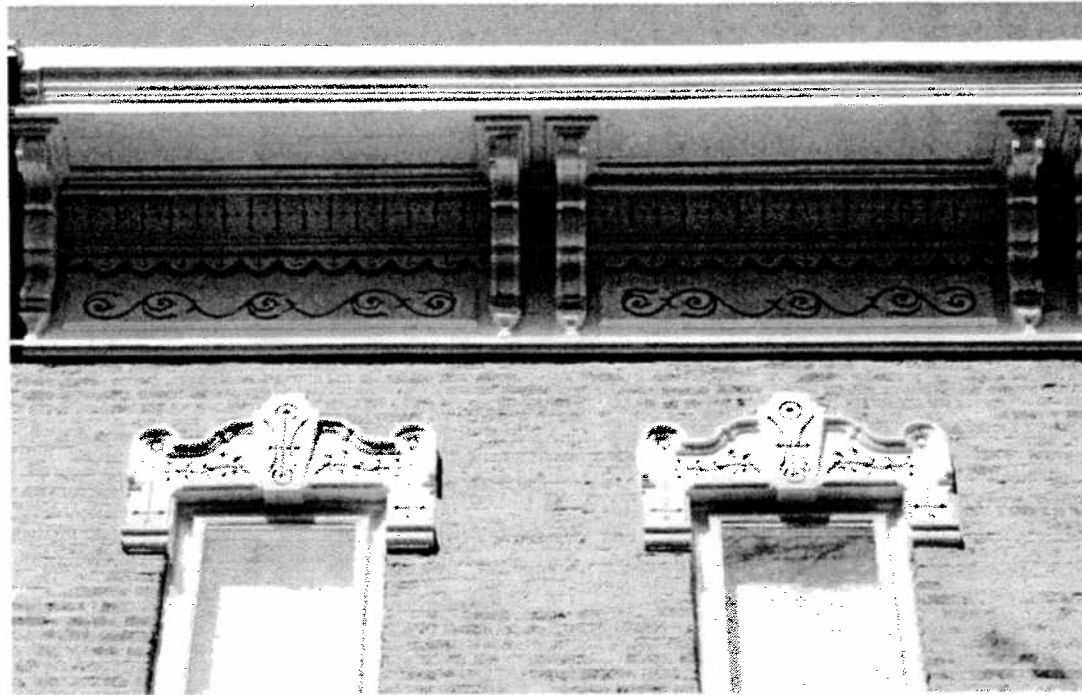
The individual row houses in the Fremont Row House District were designed in the Italianate style. Right: 2106 N. Fremont retains most original details, including a simple front stoop with cast-iron railings, a wooden "pent" roof" over a double front door, cast-stone window lintels, and wooden cornice. Above: Window lintels have prominent keystones and incising while the cornice combines paired brackets with carved dentils and scalloping.